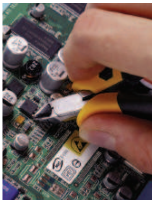
The Professional ESD side-cutter with a broad, pointed head cut soft wires flush.